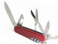
a pocket knife